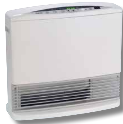
PJC-W18FR – Off White