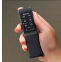
Remote Controller (Standard with all models)