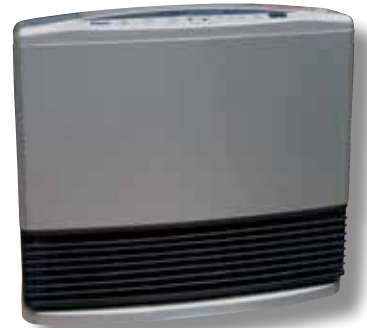
PJC-S15FR – Silver (Also available in Off White)

Paloma portable gas convector heaters offer fully automatic, thermostatically controlled heating for domestic applications. Its high performance filtered fan delivers rapid, winter warmth at floor level.