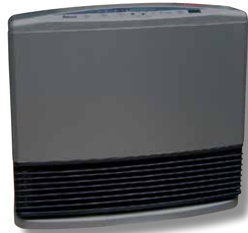
PJC-C25FR – Charcoal (Also available in Off White and Silver)