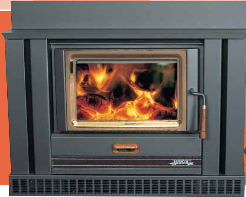
Illustrated with Gold Door option.

Arrow woodheater design has revolutionised woodheating for Australian families for decades... and now the leadership of Arrow continues. The range of Arrow heaters with their unique Triple Burn combustion system provides increased fuel efficiency and cleaner emissions.